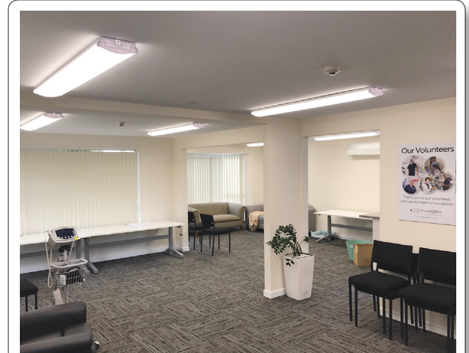
The spacious Community Room can be hired for free.

“Naylor Love has done an extraordinary job managing what was an extensive renovation. We were very impressed with their attention to detail in a project that was quite different to what they usually