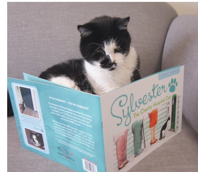
Sylvester The Charity Hospital Cat, makes a purrfect stocking filler.