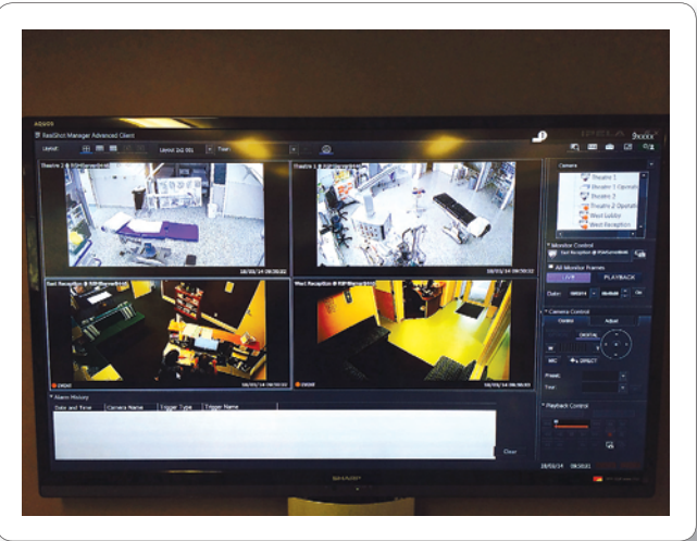
Interactive technology in our theatres.

The hospital has always used senior medical staff to provide its services and these staff are involved in teaching medical registrars and students. Since last year we have doubled the intake of student nurses who work alongside their trained counterparts, who enjoy the opportunity to work with the next generation of carers. The new interactive technology in our two theatres has also allowed us to run educational seminars for both surgeons and nurses alike.