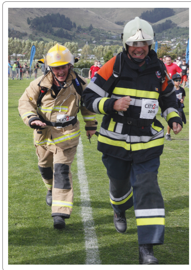
Firemen competing at this year's event.

Entries open on 1 December 2018 and more information is available at www.city2surf.co.nz .