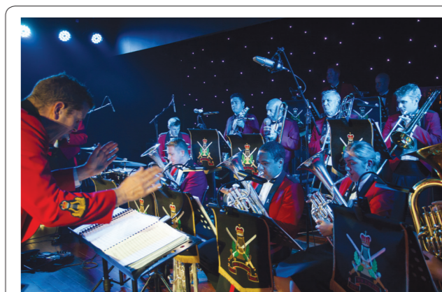
The NZ Army Band's performance will be a highlight of this year's fundraising event.

A table of 10 costs $1800 (or $180 per guest) for a three course plated dinner, dancing and an amazing