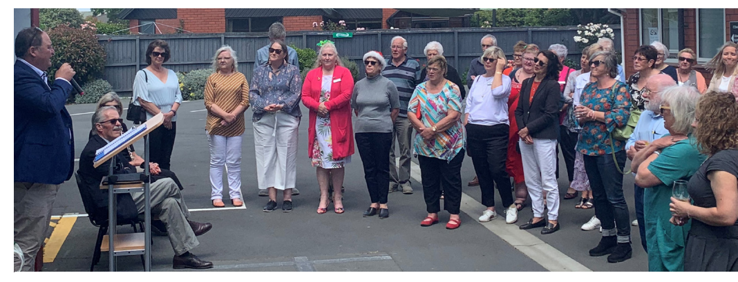
Many of the hospital's volunteers attended the re-opening ceremony.

All the Charity Hospital's services are free due to the commitment of their 300 volunteers, many of whom are medical professionals from the CDHB and private practice.